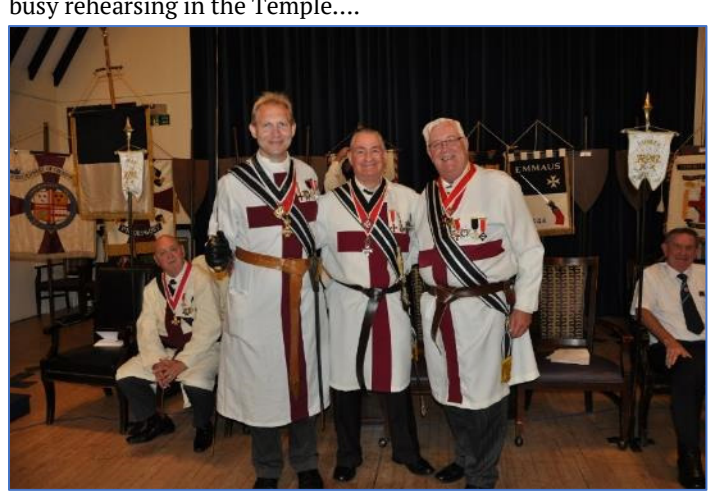
....while the rest of us were enjoying coffee and bacon butties downstairs.