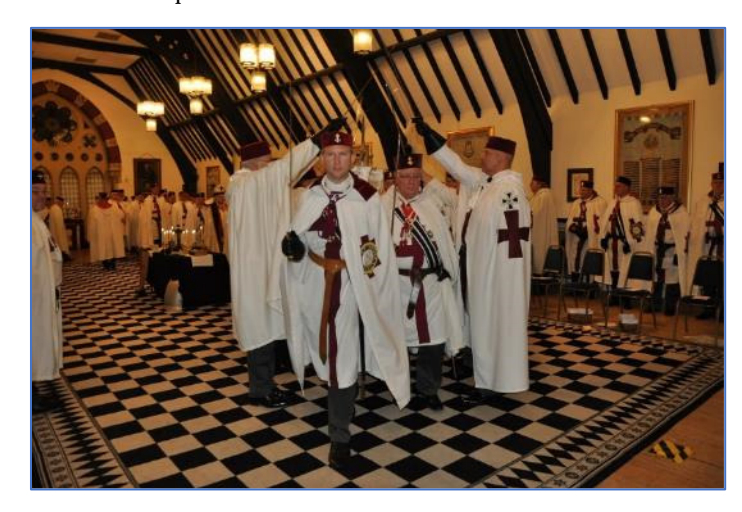
.... greeting his Honoured Guests as they retired from the Temple.