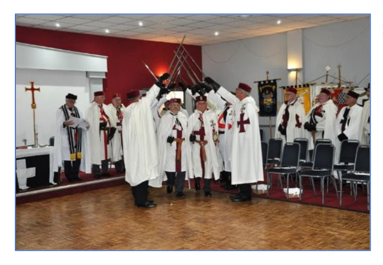
The Provincial Prior then entered the Temple preceded by the Provincial Sword Bearer and followed by the Provincial Banner Bearer.