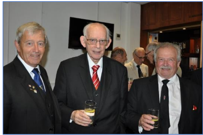
.... we were called in to lunch. The Brother Knights of the Province of Hampshire and Isle of Wight and their guests enjoyed a most convivial meal together.

We all wish the Provincial Priory of Hampshire and Isle of Wight all the best for the future.