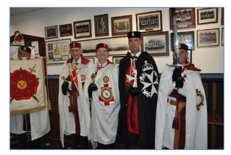
The Surrey delegation then returned for a group photo....