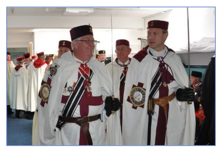
Then followed the Delegation of Knights of Malta. RE Knights and other Distinguished Guests, then entered the Temple in procession.