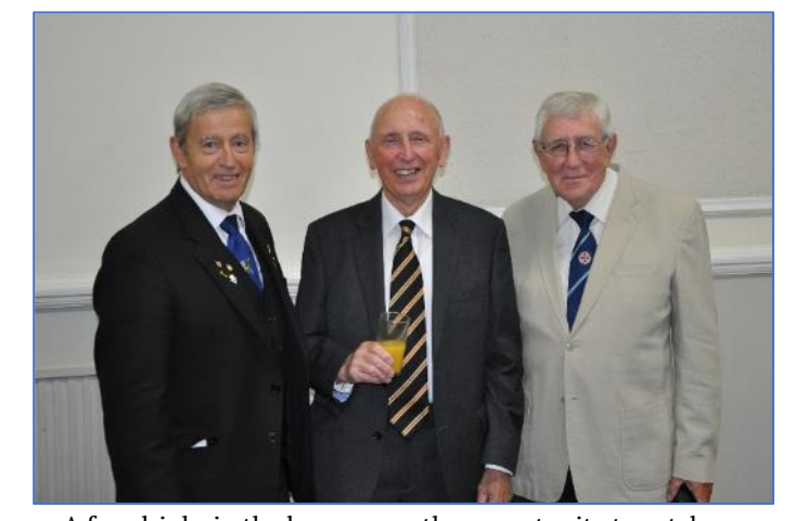
A few drinks in the bar gave us the opportunity to catch up with some old friends.......