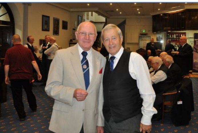
Familiar faces in the Delegation of Knights of Malta....