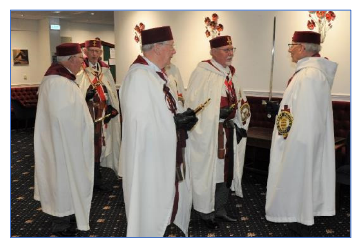
During the meeting the Preceptory Banners were paraded into Provincial Priory by the Preceptory Banner Bearers.

Provincial Priory was opened in due form and the Provincial Prior was saluted with seven under direction of the Provincial Marshal.